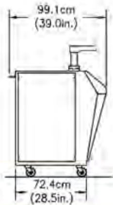
System Dimensions - Standard